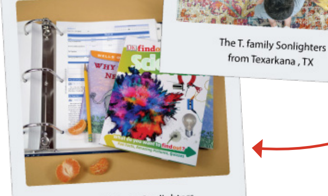
The A. family Sonlighters from Bloomington, IL

Share your #sonlightstories YOU COULD WIN $500!